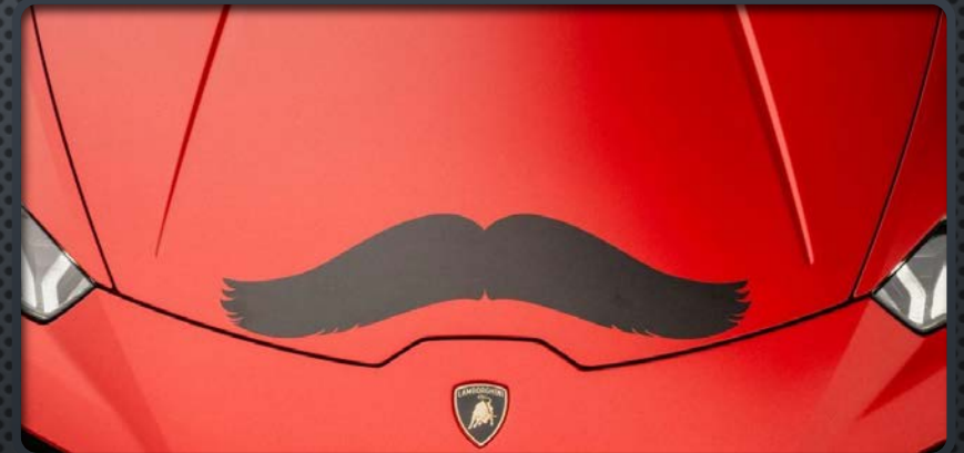
Lamborghini partnership, 2021

https://www.lamborghini.com/en-en/news/lamborghinis-human-side-unprecedented-for-movember