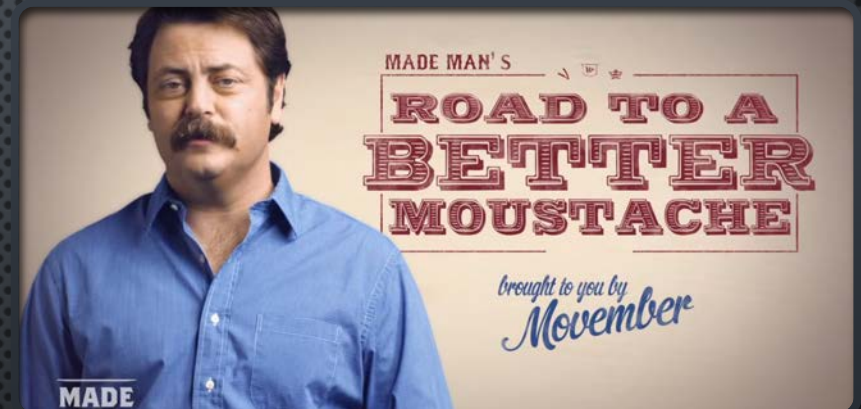
Nick Offerman, Movember ad, 2012 https://www.youtube.com/watch?v=8w1p5UI7Siv