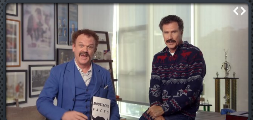
Will Ferrell & John C. Reilly, Holmes & Watson Movember ad, 2018

www.traileraddict.com/holmes-watson/viral-movember-psa